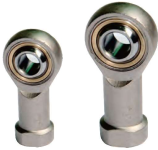
Table for universal joint and cylinder